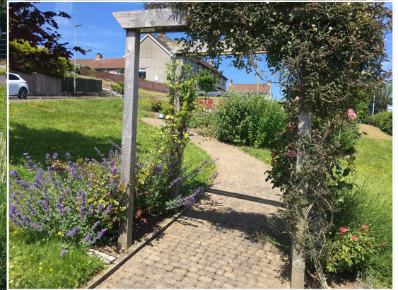
The Queen's Park flowerbeds, seating area and pergola