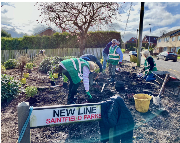
The transformation of the shrub bed at the junction of New Line / Downpatrick Street