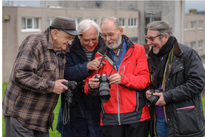
u3a members enjoy sharing their interest in photography

For more information about u3a visit our websites www.u3ani.info or www.u3a.org.uk .