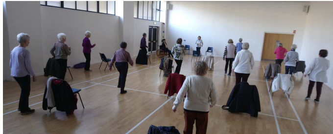
Monday morning's Chair Based Exercise class in the Main Hall of Saintfield Community Centre

category, from nearly 40 entries in this category. This is the fifth award for SCA Greens in the last five years, which is excellent. With a little more help from you all next year, perhaps this very good result could be exceeded.