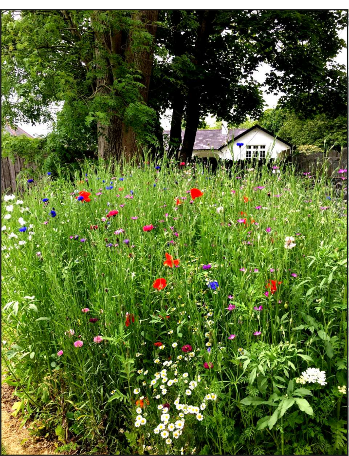
Wild flowers make a colourful display in the Memorial Garden in the graveyard of First Saintfield Presbyterian Church

Perhaps some of you reading this article might consider joining us in keeping Saintfield beautiful! We'd like to thank those of you who litter-pick in your own areas - this is much appreciated.