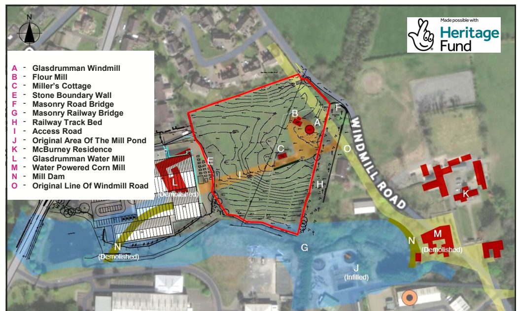
Overlay of key elements from historic maps onto current site plan of the windmill field, bounded by the red line, and the surrounding area

The McBurney Windmill in the 'Windmill Field' is a much-loved local landmark. The quandary was how to protect both the windmill and the buildings around it while making it beneficial to the local community. The windmill and the history of the surrounding area are an important part of Saintfield's heritage.