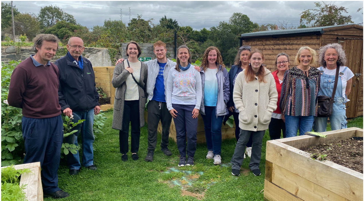
The Community Garden group in the Community Garden

The community garden is coming into its second year of growth. It has enjoyed a great first year and harvest, building up a team of members who have had great fun taking care of the plants and space.