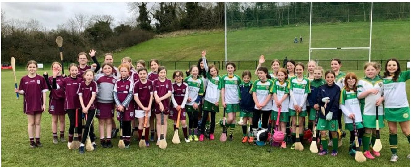
Darragh Cross GAC Under 11.5 Camogie Team

Senior Camogie – Monday and Wednesdays @ 7pm