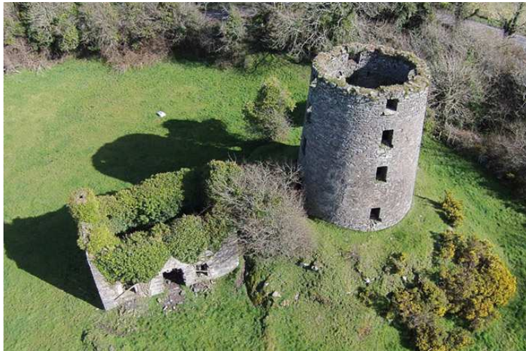
The windmill stump in the windmill field.

approved. These studies have since been completed to the satisfaction of the HLF and have shown that there are no impediments for the field to be developed as a community heritage park.