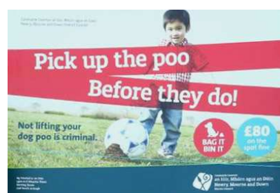
NMD District Council poster

evidence or other proof of offending. The latest development is that after much lobbying by our councillors, NMD Council has agreed to engage one more full-time enforcement officer, together with three seasonal officers. Council have also agreed to explore the possibility of DNA testing to try and curb the menace.