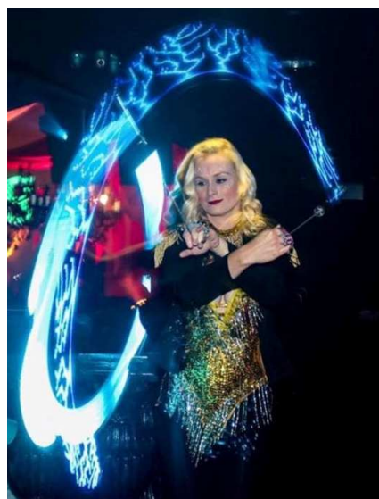
LED light performances will be one of the attractions at the Christmas Fair

This year two street entertainers, Becky and Cleo, will thrill the crowd with dazzling light displays which they will perform at intervals throughout the evening.