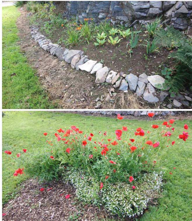
The cliff face plant and poppy beds at the Lisburn Road / Old Belfast Road junction

Planting began in the spring. The rock strata lie at a steep angle, therefore soil does not stay on the sloping ledges. To help it stay put, stones were cemented into place to build up small "ledge beds" where the existing thin soil could be mixed with compost and planted with small drought-tolerant plants; pink Saxifrages, blue Prattia, white Vinca minor, and small blue Campanula. Empty toothpaste tubes with the ends cut off