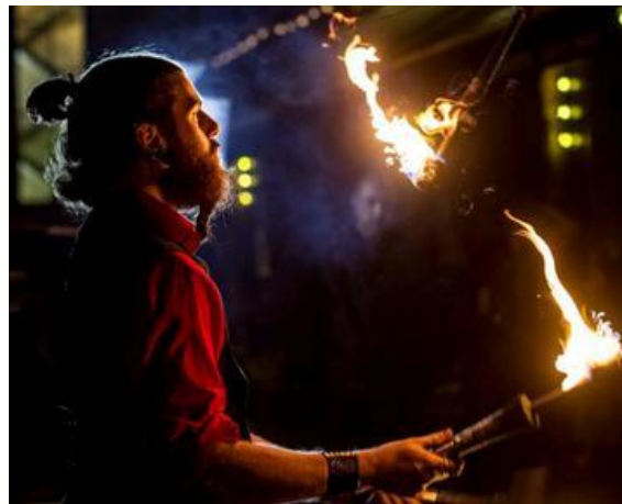
Logy on Fire will be performing at The Fair

Remember to check out our website discoversaintfield.com and our Facebook page for the latest news. See you at the Fair!