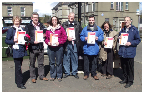
The launch of Issue 1 of Saintfield News

c/o 60 Woodrow Gardens, Saintfield, BT24 7WG.