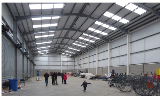
The existing Building C at the Belfast Road site

The drawings display a sports theme in Building A for an indoor synthetic sports pitch and associated changing facilities and toilets. The layout of the facility lends itself to soccer and Gaelic training as well as three 5-a-side pitches played across the main pitch.