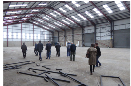
The existing Building A at the Belfast Road site

Mr Lipsett concluded, "As a Council we are committed to both these proposals with the upgrade of the shale hockey pitch and the development of the Belfast Road Site in Saintfield being on our Capital Works programme since the start of the new Council in April 2015."