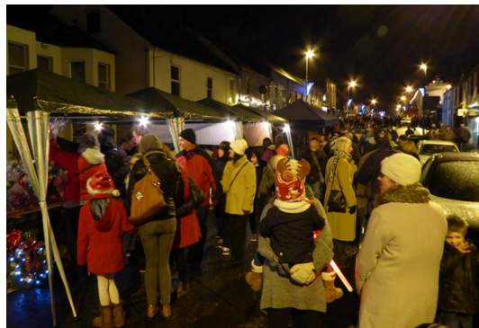
Last year's street market.

The fair seems set to provide an evening of fun, frivolity and seasonal good cheer for the whole family, so make a point to be there and get into the Christmas spirit.