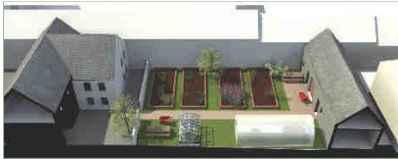
Architect's impression of Rowallane Community Hub

In conjunction with local schools and gardeners, the allotments at the rear will provide locally grown produce and horticultural training.