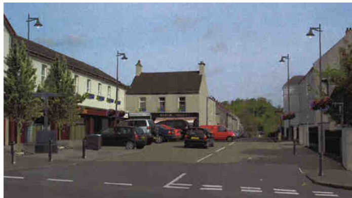
Architect's impression of The Square

The work will include the replacement of the pavements and road surface, new street furniture, new lighting and some planting.