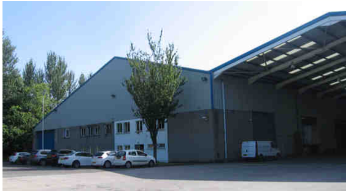
The Belfast Road site of Saintfield's Community Centre

bookable meeting rooms (large, medium and small). An arts and crafts area and exhibition space were next in favour, followed by public artwork, which received the least support, though still voted for by 129 people.