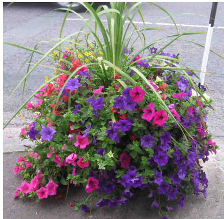
A planter tub in full bloom last summer.

As advised in the last issue of Saintfield News, our village won