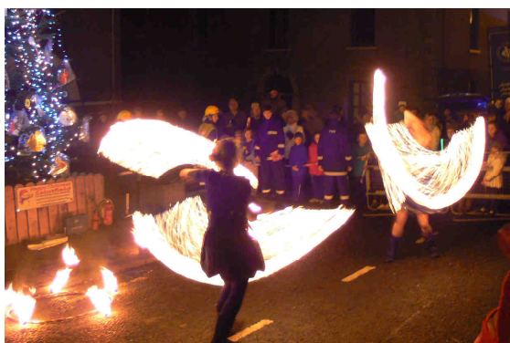
FirePoise in action on Main Street last Christmas

the village in a festive aura. He will be available to sign autographs and will also judge the window displays in the shops to decide the winner of shop competition.