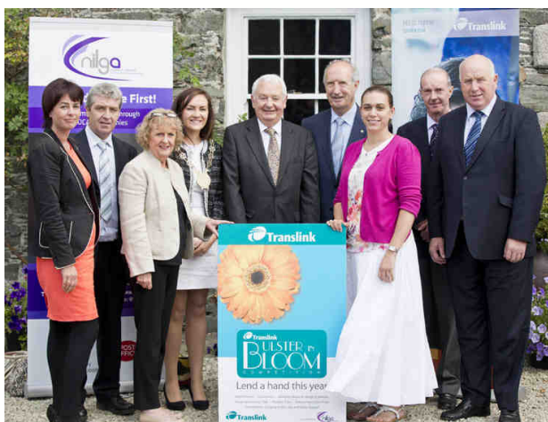
Saintfield won awards in two categories of the 2013 Translink Ulster in Bloom competition

Winter planting has been completed in the tubs, with under planting of daffodils and tulips to come up in the Spring. The committee members have clubbed together to buy the daffodils and have also given several hundred, along with tulips donated by Saintfield Nurseries, to the three schools for the pupils to plant. Some have been planted in the Memorial Garden.